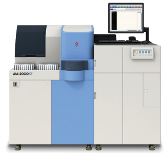
AIA-2000 200 Tests Per Hour