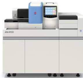
AIA-900 with 9 Tray Sorter 90 Tests Per Hour Also available with 19 Tray Sorter and as Loader Model