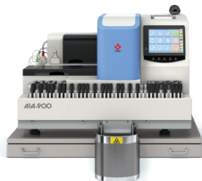
AIA-900 Benchtop 90 Tests Per Hour